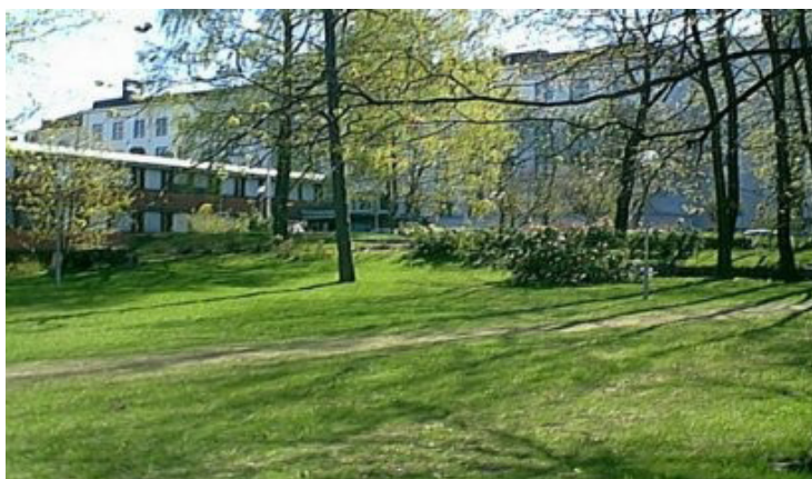
Neurosurgery, Helsinki University Hospital