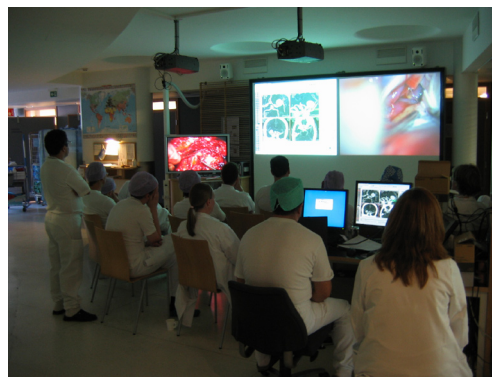
Course participants during the 2008 course.